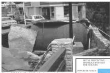
Figure 3.2.3.1A: Tank lifted by buoyancy forces